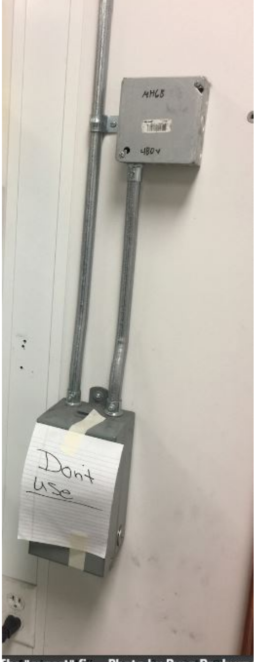
The "expert" fix. - Photo by Ryan Rayburn, Puget Sound Chapter