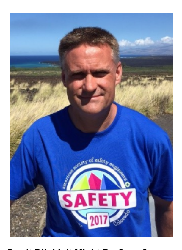
Don't Blink! It Might Be Over Soon...

As the NW Chapter wraps up another year and my Presidential term comes to an end, I am now realizing how fast this time went! While I am sad to see things come to a close, I think it is important to look back and reflect on the accomplishments, member activities, and the future of where ASSP is going. Before anymore time passes us by, I would like everyone to pause and look back because if we don't, September will be here and the previous Chapter year will be forgotten.