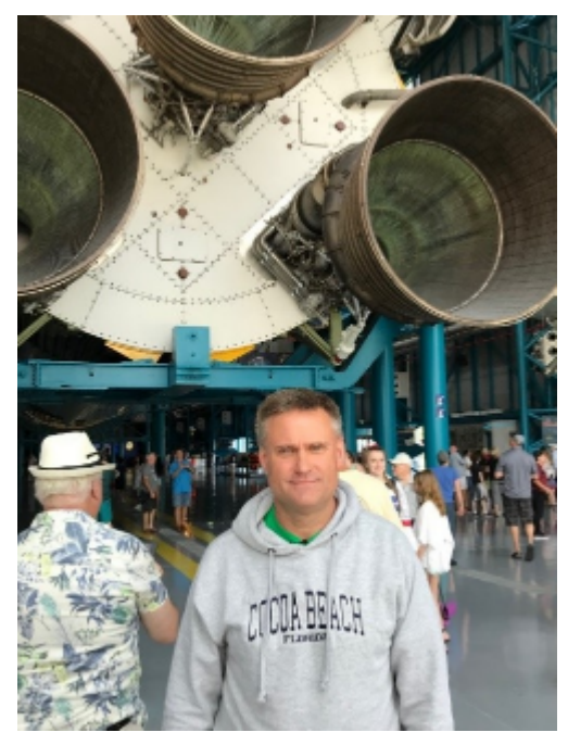
Apollo 11 & Saturn V Rocket taking us to the Moon

I am certain that all of us as Safety & Health Professionals encounter and deal with challenges on a regular basis as part of our jobs. From seatbelts not being used on a sit-down forklift to reminding workers to label hazardous chemical containers to keeping aisleways/walkways clear, the hazards are