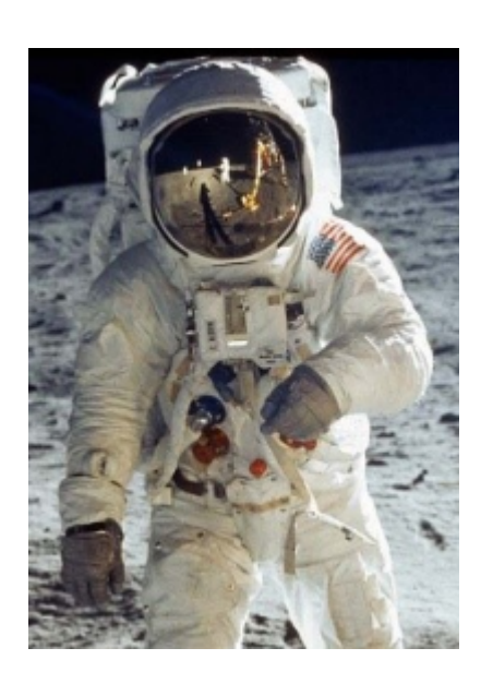
Apollo 11 Astronaut on the Moon

And please do not forget about one of the most valuable resources that you can tap into when presented with a challenging safety situation in your jobyour peers and fellow members of ASSP. Our Chapter has over 850+ members and there is a good chance that one of our members has previously had to deal with a similar challenge that you might be faced with. Please come to our monthly meetings and network with fellow members- we are here to help!